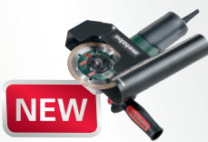
5" TuckPoint Set T 13-125 TuckPoint Set