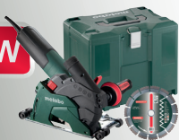
5" Concrete Cutter Set T 13-125 CED Set