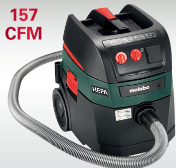
ASR 35 ACP HEPA Auto Clean Vacuum 602057800