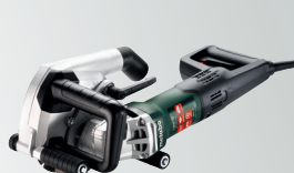
Wall Chaser MFE 40